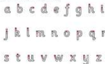
Letter Formation Practice Sheet